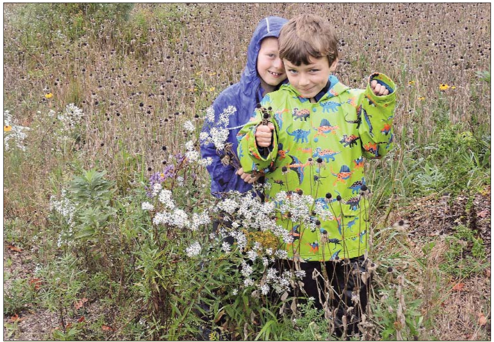
For the first time, the GRCA volunteer program offered a Professional Activity (PA) day activity for kids and their parents at Guelph Lake. They collected wildflower seeds and then planted them on the site of the new Guelph Lake Nature Centre.

Precipitation during the first two weeks of September was fairly consistent across the