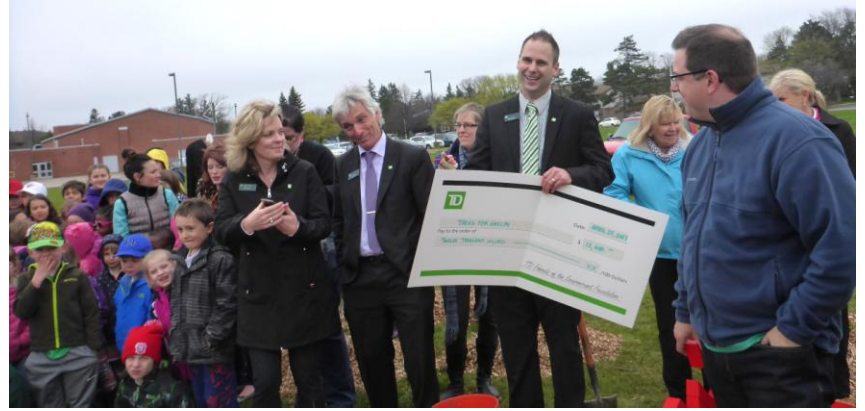
Mayor Guthrie was on hand for the cheque presentation from the TD Friends of the Environment Foundation at the Canada 150 Celebration Forests kickoff at St. Rene Goupil and Priory Park Schools.

A number of Canada 150 Celebration mini-forests were planted on school sites by school children throughout the City. The graphic above was included on the signs located at each forest.