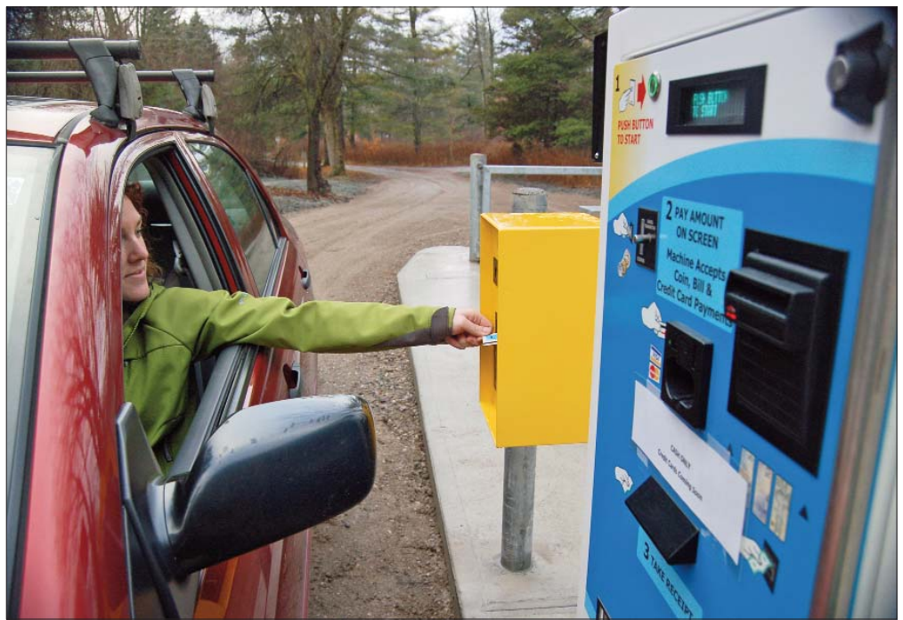
The new access gate means that Shade's Mills Park in Cambridge is open year-round. Visitors can use a Park Membership pass to enter without paying, or can pay using cash (bills and coins). Soon, credit cards will also be accepted for payment.

This type of gate is planned for other parks within the next few years.