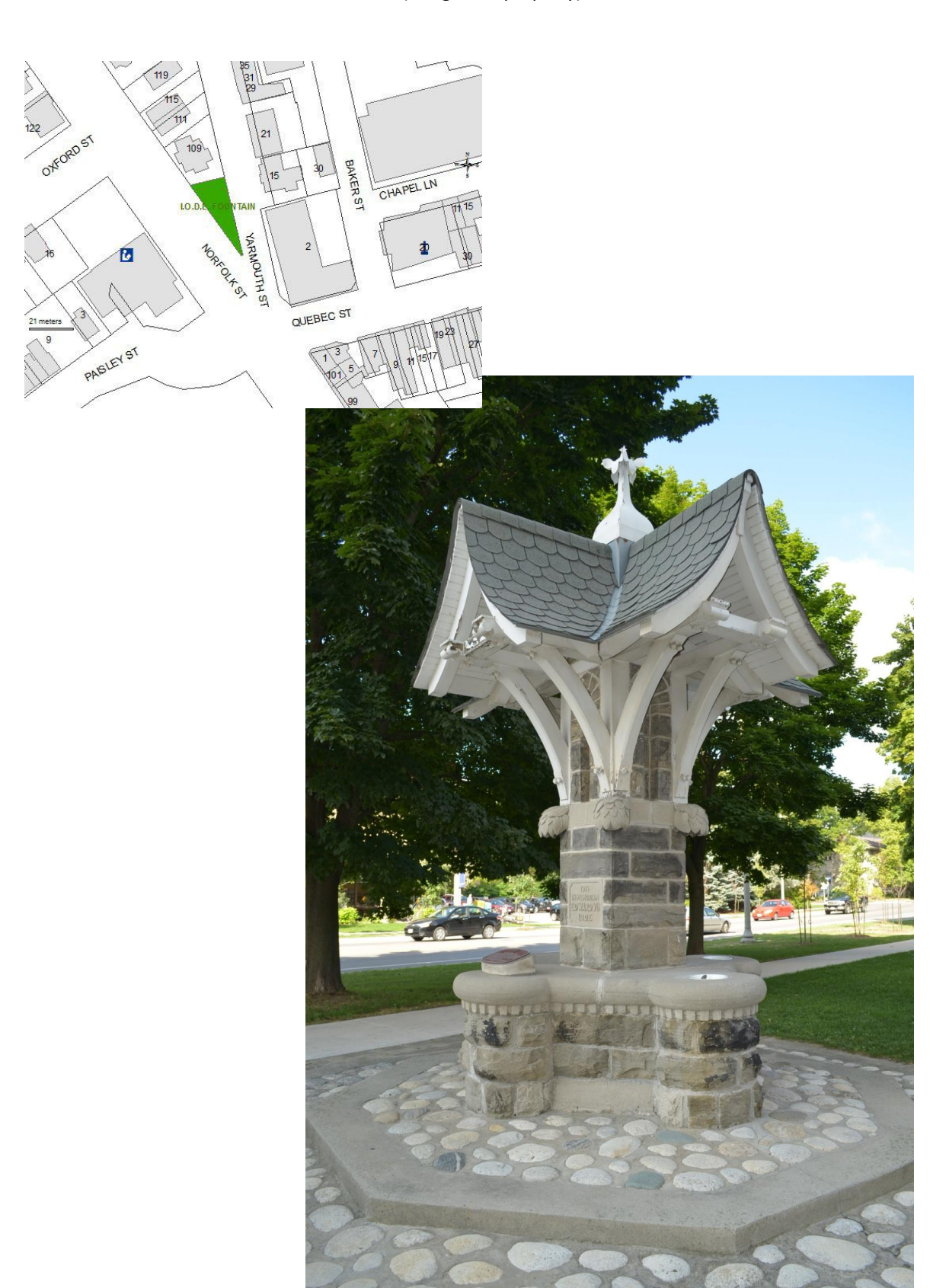
Item 6.3 I. O. D. E. Fountain (designated property)