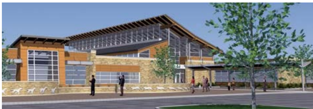
Winnipeg Humane Society