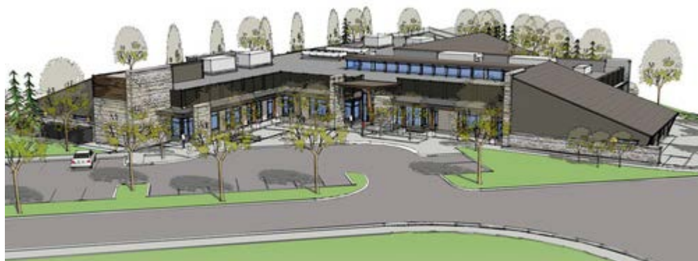
Ottawa Humane Society