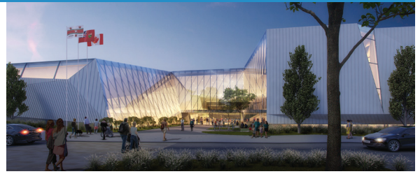
Main entrance view from east. Artist's interpretation. Subject to change.