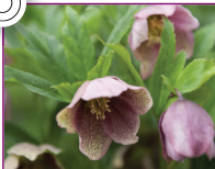
Helleborus spp. lenten rose