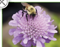
Scabiosa spp. pincushion flower