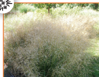
Deschampsia spp. tufted hair grass