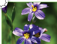
Sisyrinchium spp. blue-eyed grass