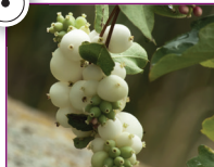
Symphoricarpos spp. snowberry