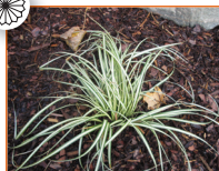
Carex oshimensis 'Evergold' variegated Japanese sedge