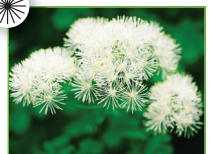
Thalictrum spp. meadow rue