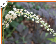
Cimicifuga racemosa snakeroot