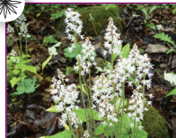
Tiarella cordifolia foamflower