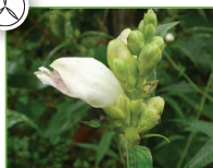
Chelone glabra white turtlehead