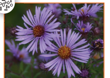
Symphyotrichum laeve smooth aster