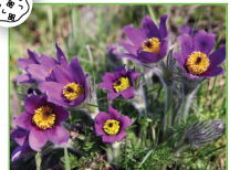
Pulsatilla spp. pasque flower