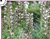
Acanthus mollis bear's breeches