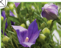
Platycodon grandiflorus balloon flower