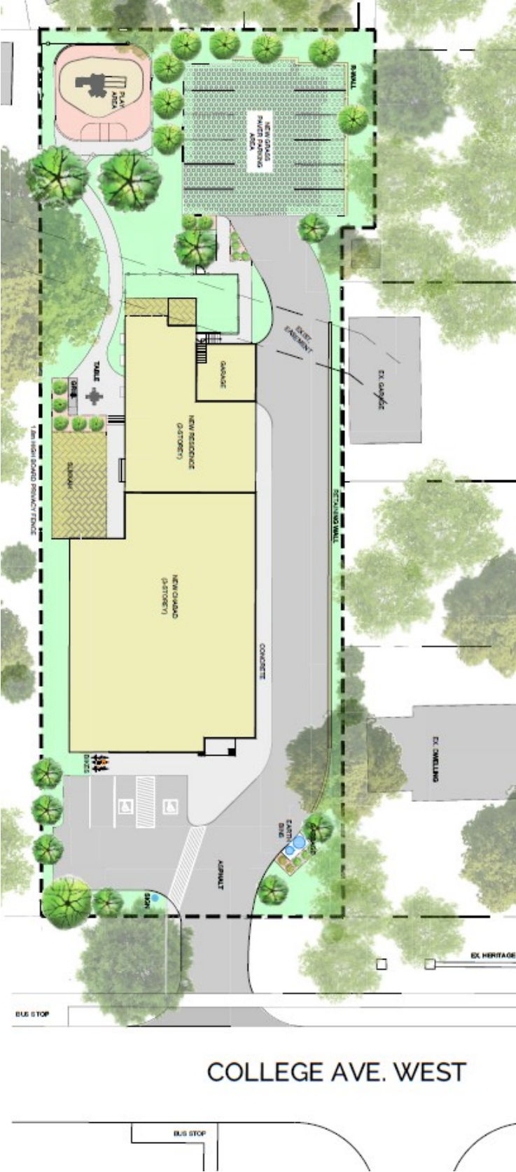
Figure 1: Proposed Site Plan