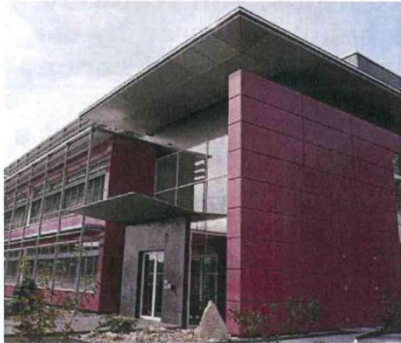
Aluminum cladding panels