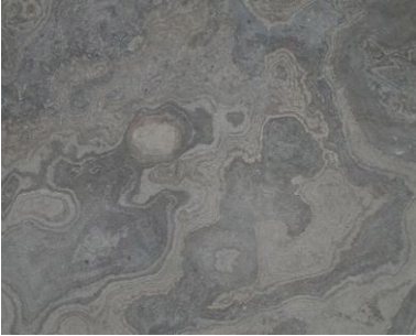
“Eramosa” limestone – fleuri-cut (Ledgerrock, Owen Sound)