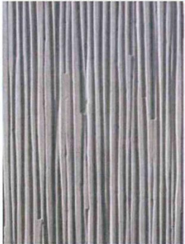
Precast concrete formliner panels