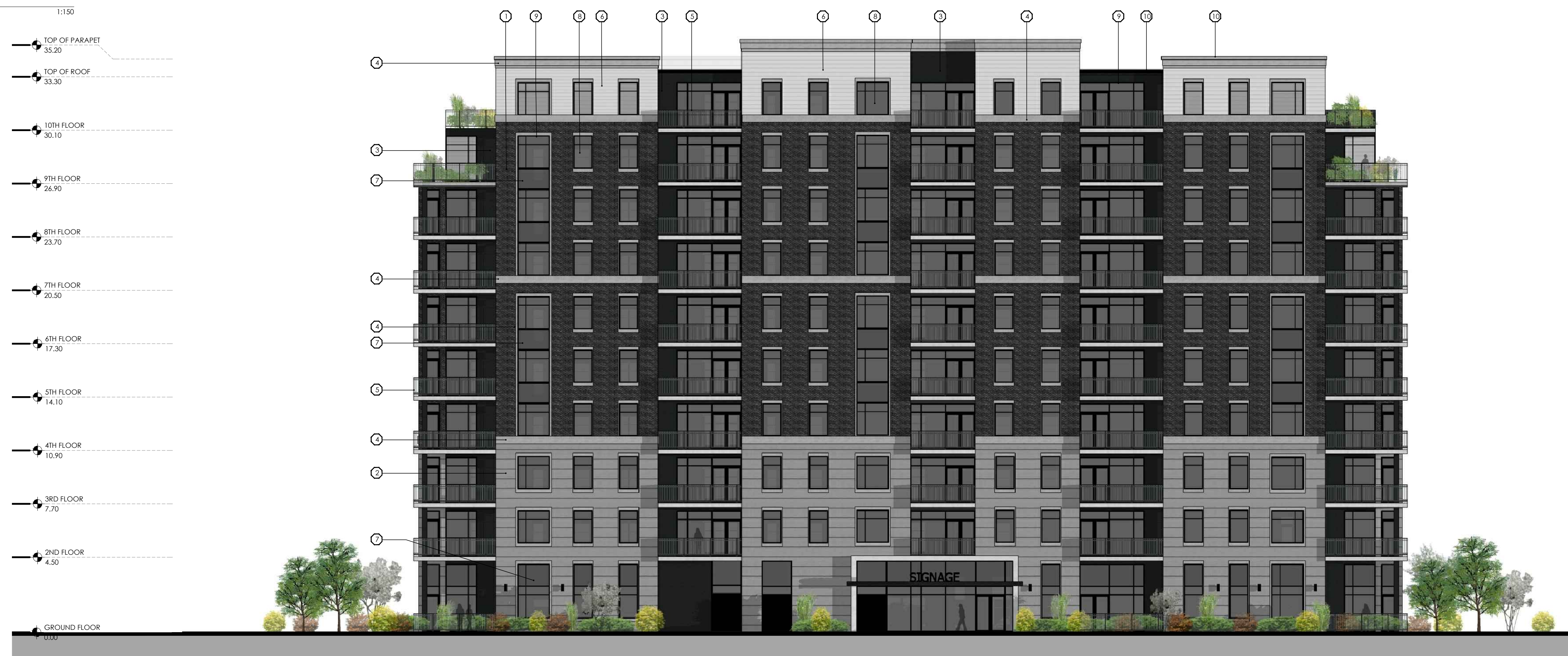
02 WEST ELEVATION EP-4

THIS DRAWING IS AN INSTRUMENT OF SERVICE & IS THE PROPERTY OF ABA ARCHITECTS INC. & CANNOT BE MODIFIED AND/OR REPRODUCED WITHOUT THE PERMISSION OF ABA ARCHITECTS INC. THE CONTRACTOR MUST VERIFY ALL DIMENSIONS ON SITE AND REPORT ANY DISCREPANCIES TO THE ARCHITECT, BEFORE PROCEEDING WITH THE WORK. DRAWINGS ARE NOT TO BE SCALED.