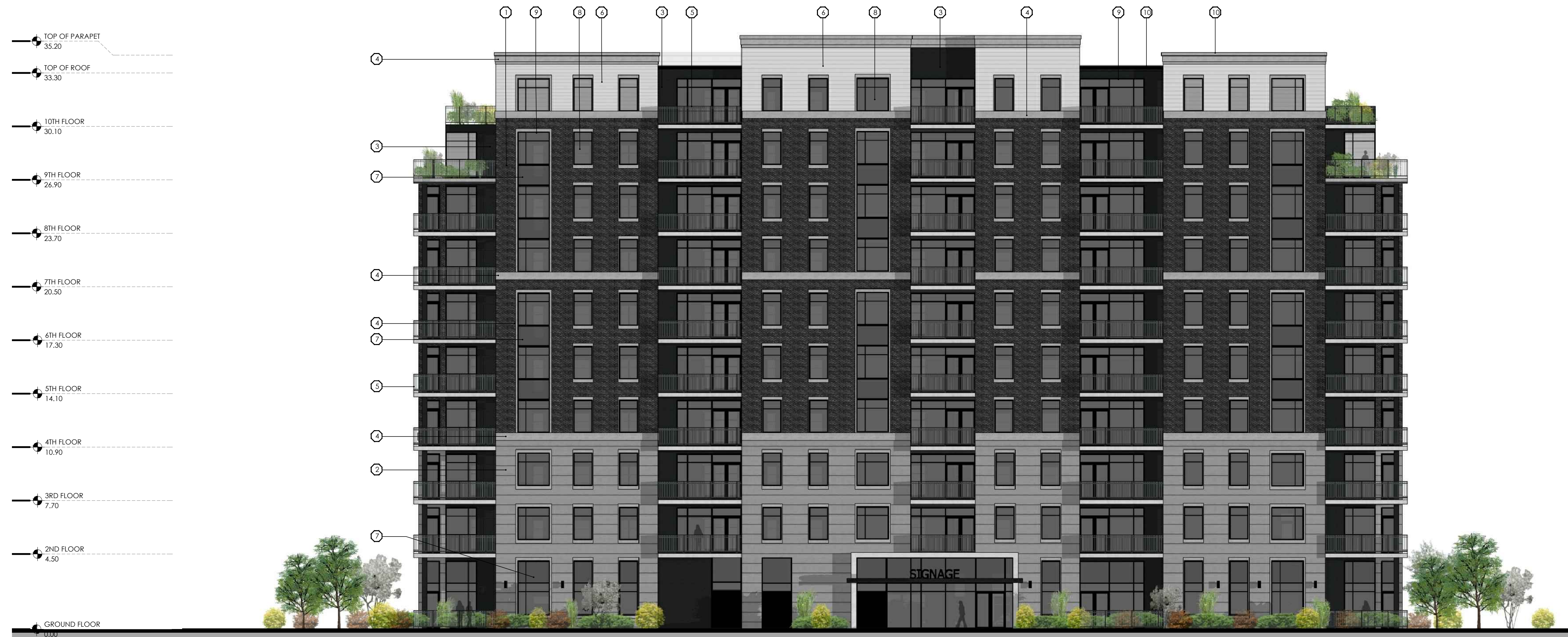
01 EAST ELEVATION EP-4