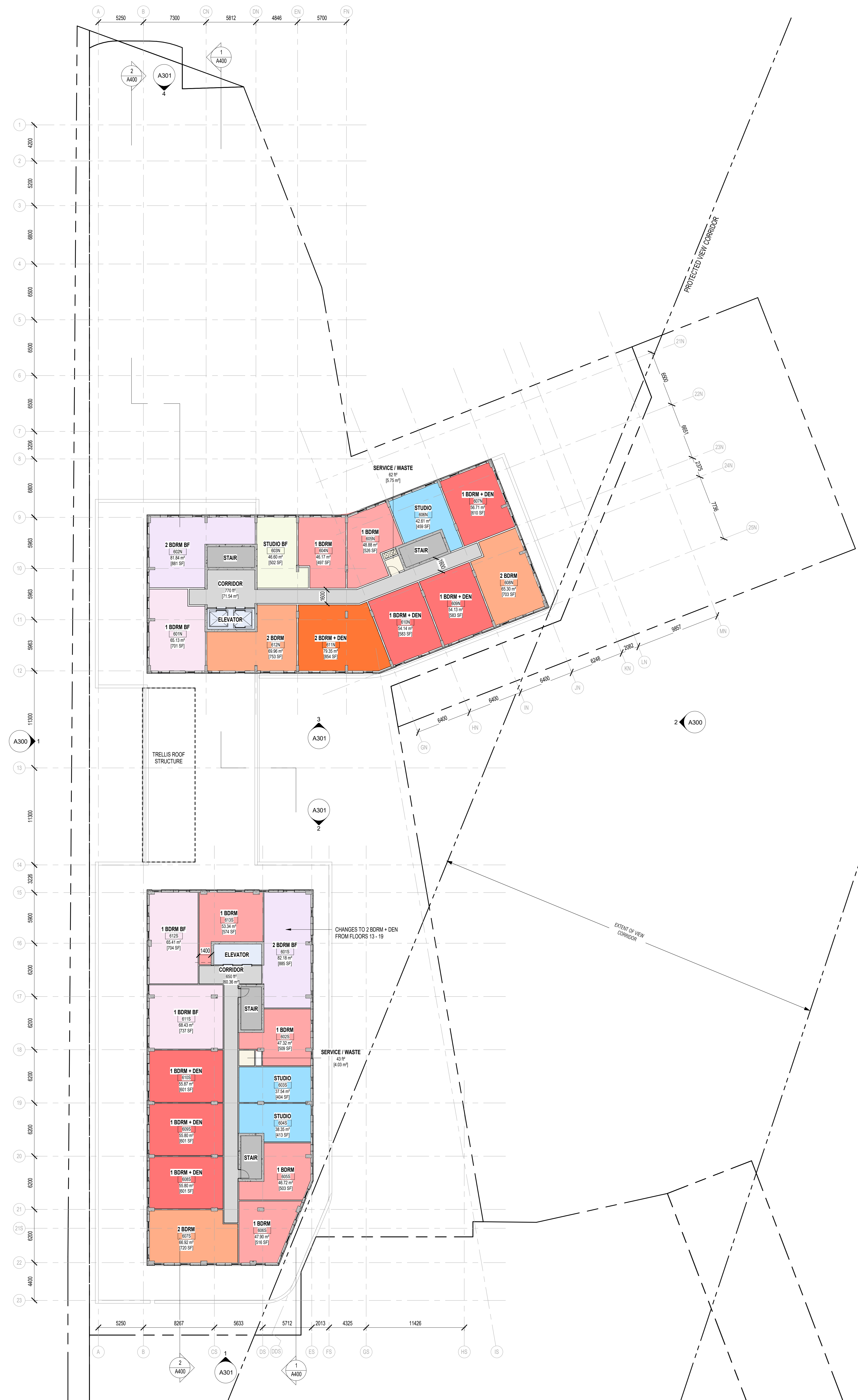
2 OVERALL AREA PLAN - LEVEL 6 (TYPICAL TOWER PLAN)