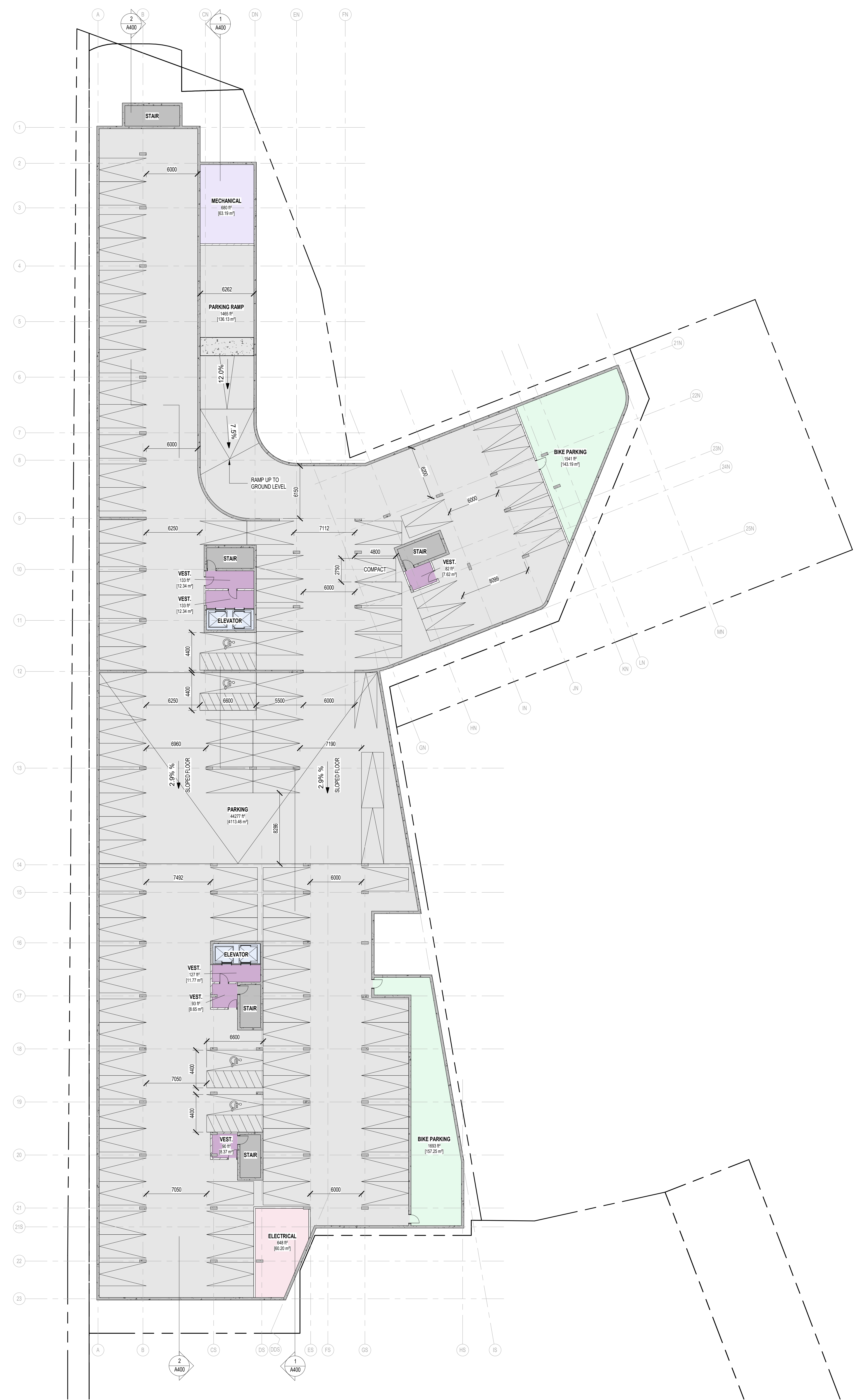
1 OVERALL AREA PLAN - LEVEL P1 A200 1:200

*THE DEDICATED TYPE 'B' ACCESSIBLE SPACES ARE DEEPER THAN WHAT'S REQUIRED BY THE CITY OF GUELPH TO MEET THE ACCESSIBILITY REQUIREMENTS FOR A CMHC AFFORDABLE HOUSING PROGRAM.