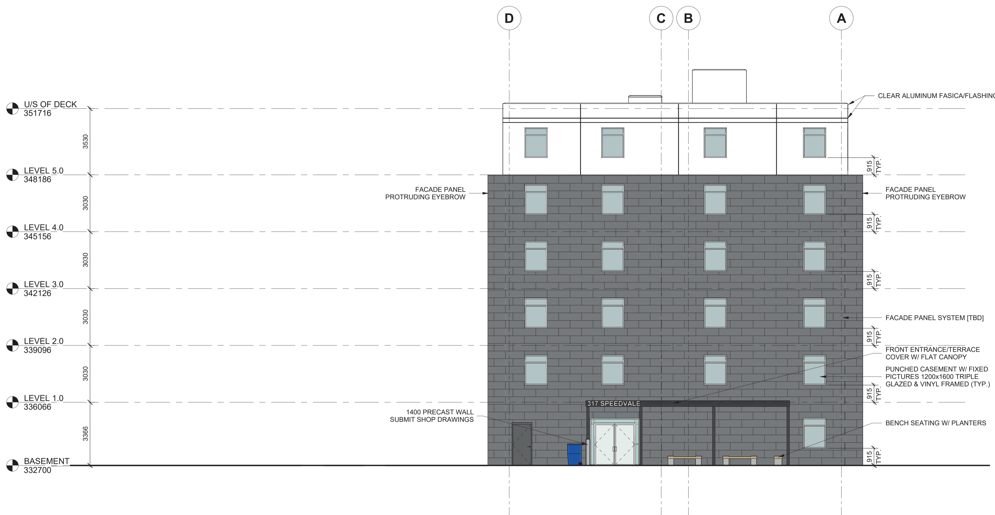
EAST BUILDING ELEVATION SCALE: 1 : 100