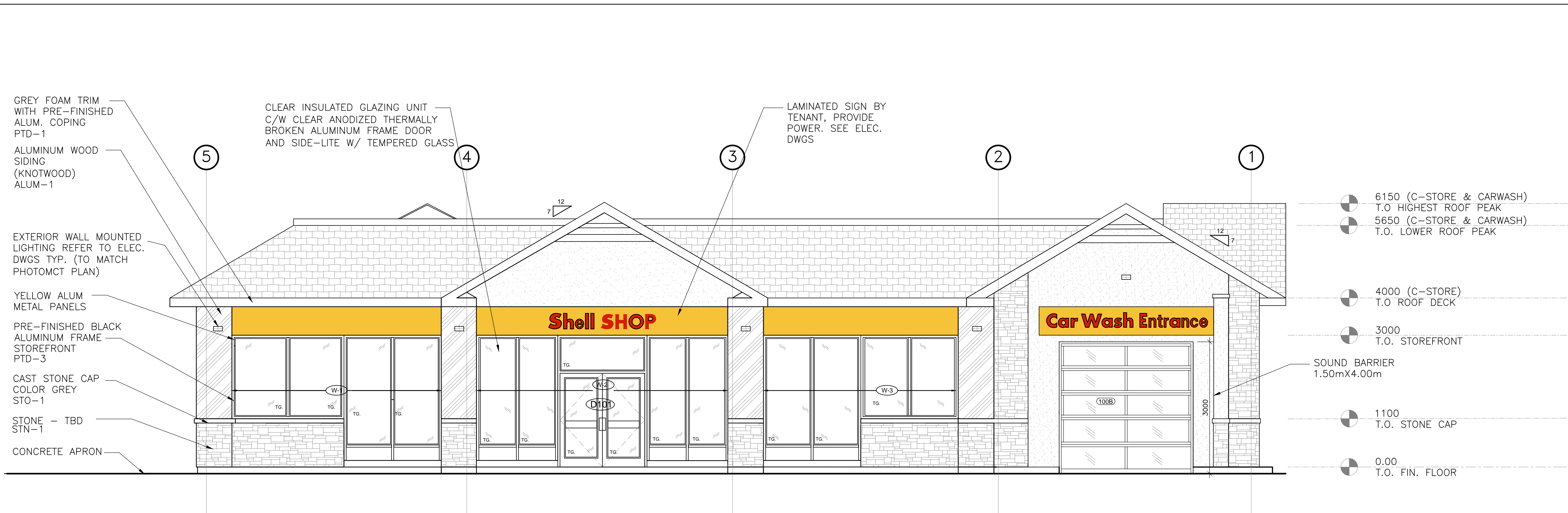
1 EAST ELEVATION SCALE 1:50