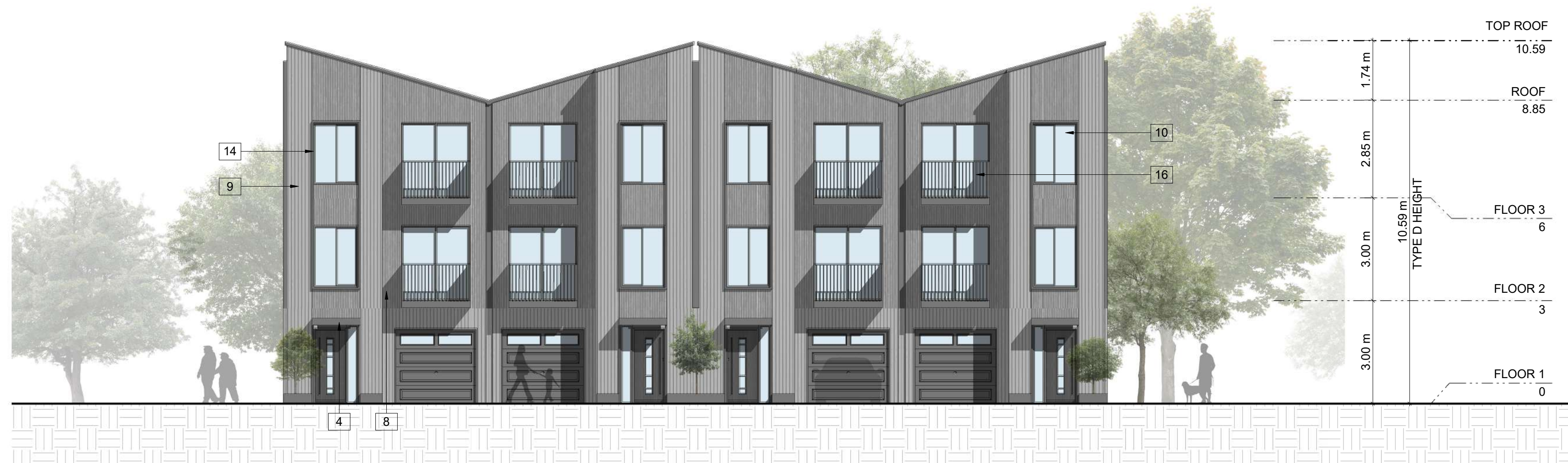
2 TH NORTH-WEST ELEVATION - TYPE D RZ309 1 : 100