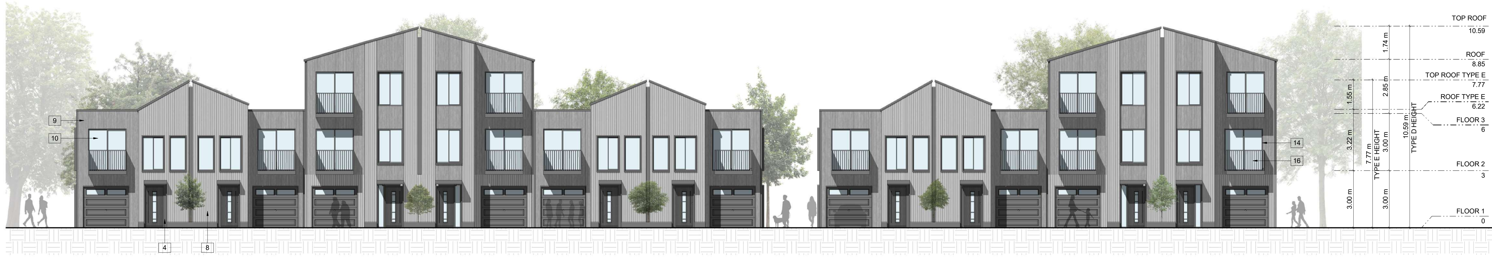
1 TH WEST ELEVATION - TYPE D - E RZ309 1 : 100