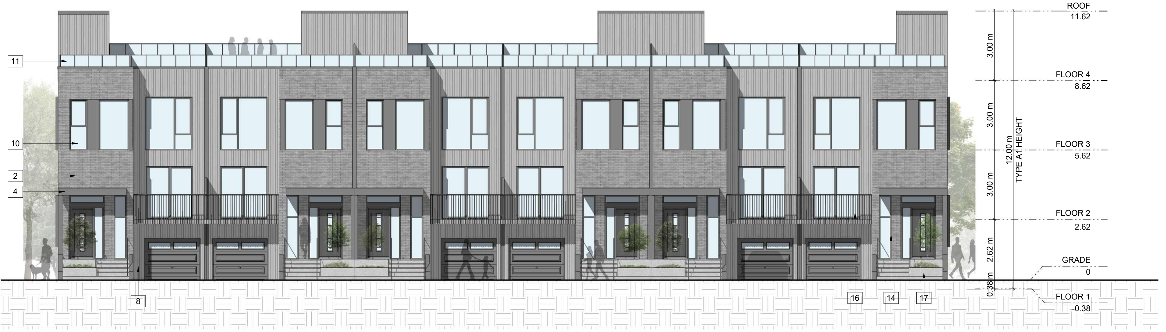
3 TH WEST ELEVATION - TYPE A1 RZ307 1:100