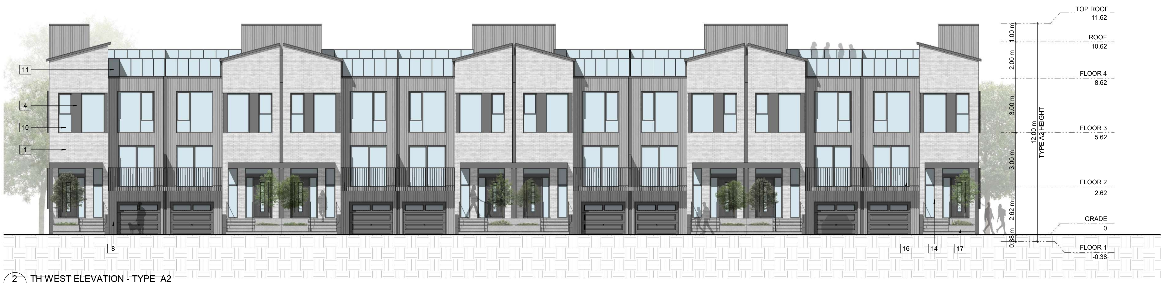
2 TH WEST ELEVATION - TYPE A2 RZ307 1:100