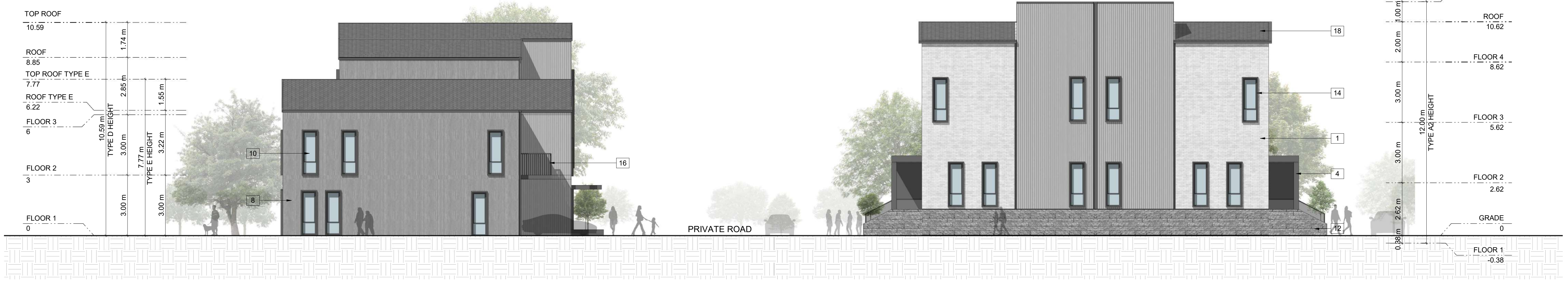
1 TH NORTH ELEVATION - TYPE A2 - E RZ307 1:100