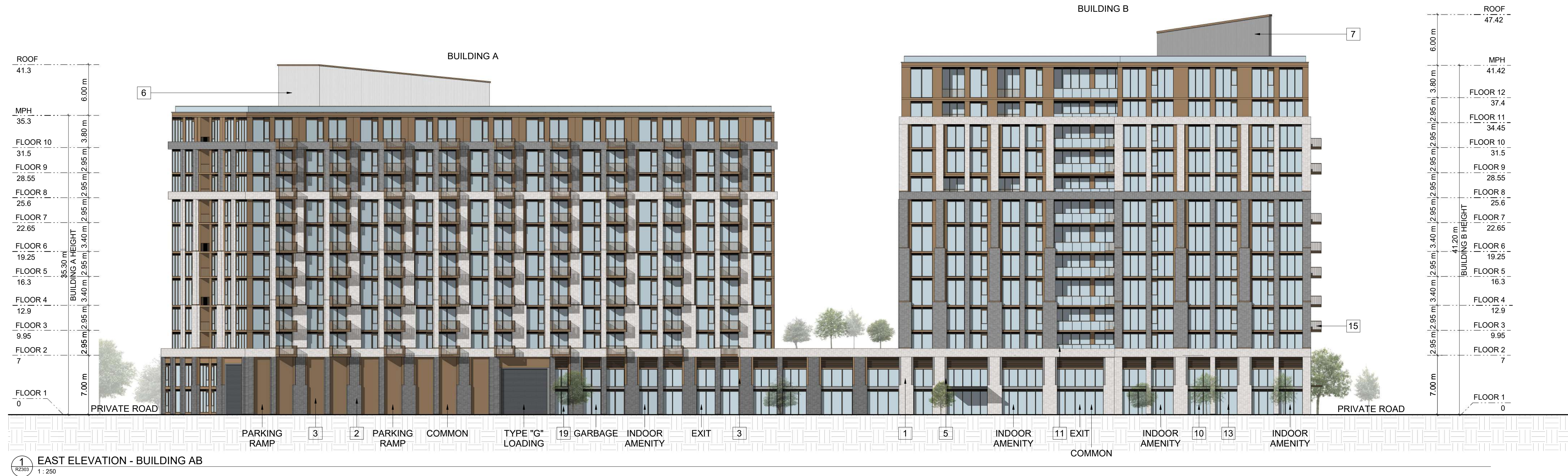
1 EAST ELEVATION - BUILDING AB RZ303 1:250

This drawing, as an instrument of service, is provided by and is the property of Turner Fleischer Architects Inc. The contractor must verify and accept responsibility for all dimensions and conditions on site and must notify Turner Fleischer Architects Inc. of any variations from the supplied information. This drawing is not to be scaled. The architect is not responsible for the accuracy of survey, structural, mechanical, electrical, etc. information shown on this drawing. Refer to the appropriate consultants' drawings before proceeding with the work. Contractor must conform to all applicable codes and requirements of all applicable having jurisdiction. The contractor working from drawings not specifically marked "for Contractor" must assume full responsibility and bear costs for any corrections or damages resulting from his work.