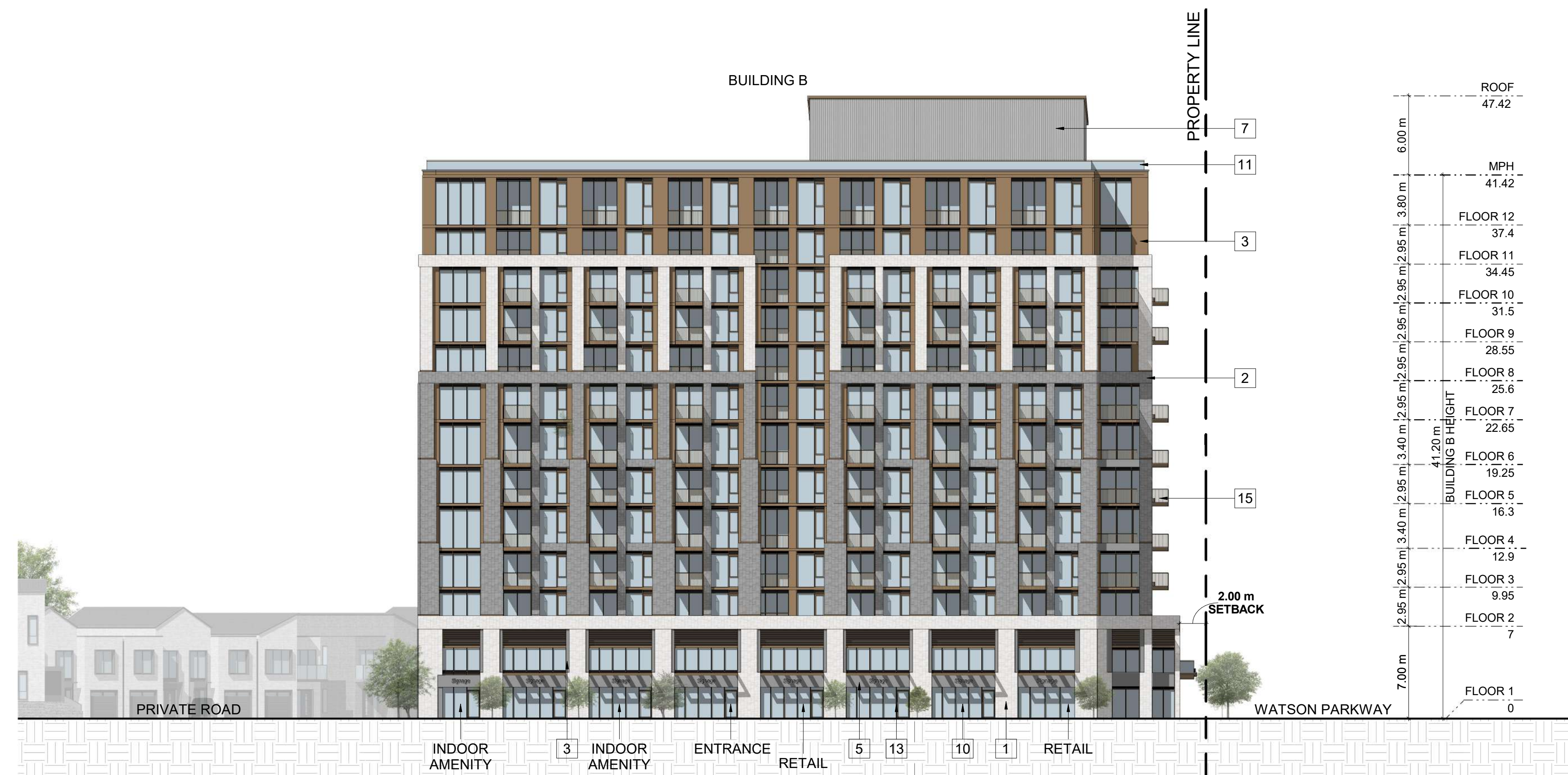
2 NORTH ELEVATION - BUILDING AB RZ303 1:250