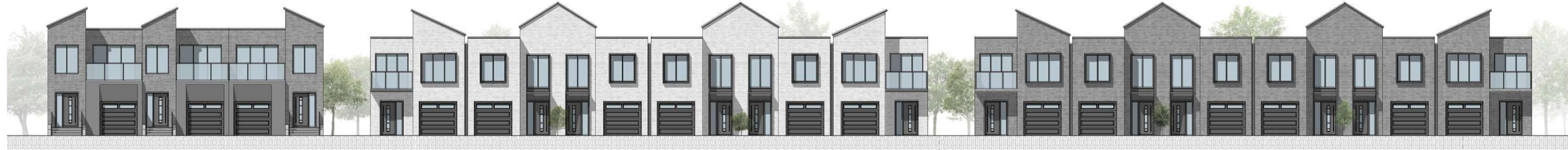
3 STREET WEST ELEVATION - TYPE B - C RZ302 1:200