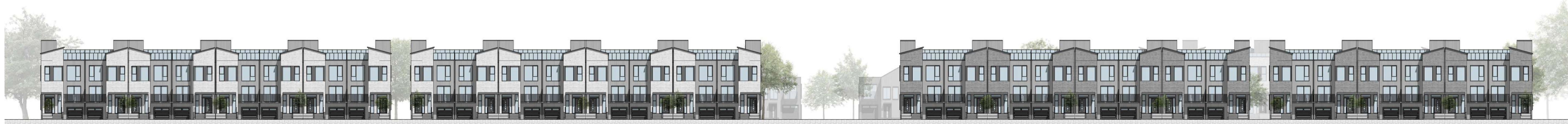
2 STREET WEST ELEVATION - TYPE A - 2 RZ302 1:300