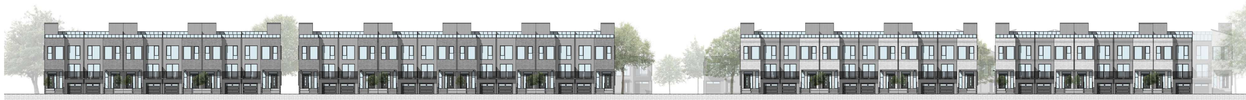
1 STREET WEST ELEVATION - TYPE A - 1 RZ302 1:300