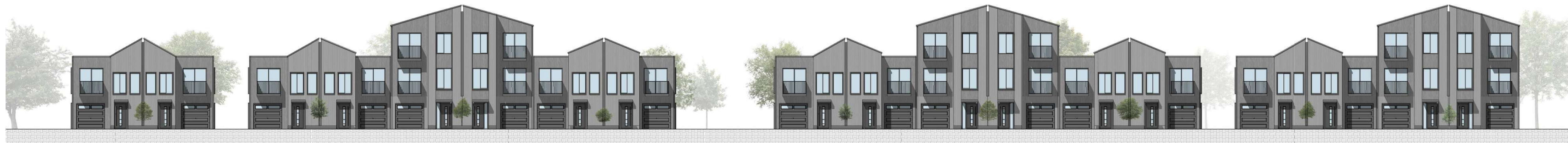
4 STREET WEST ELEVATION - TYPE D - E RZ302 1:200