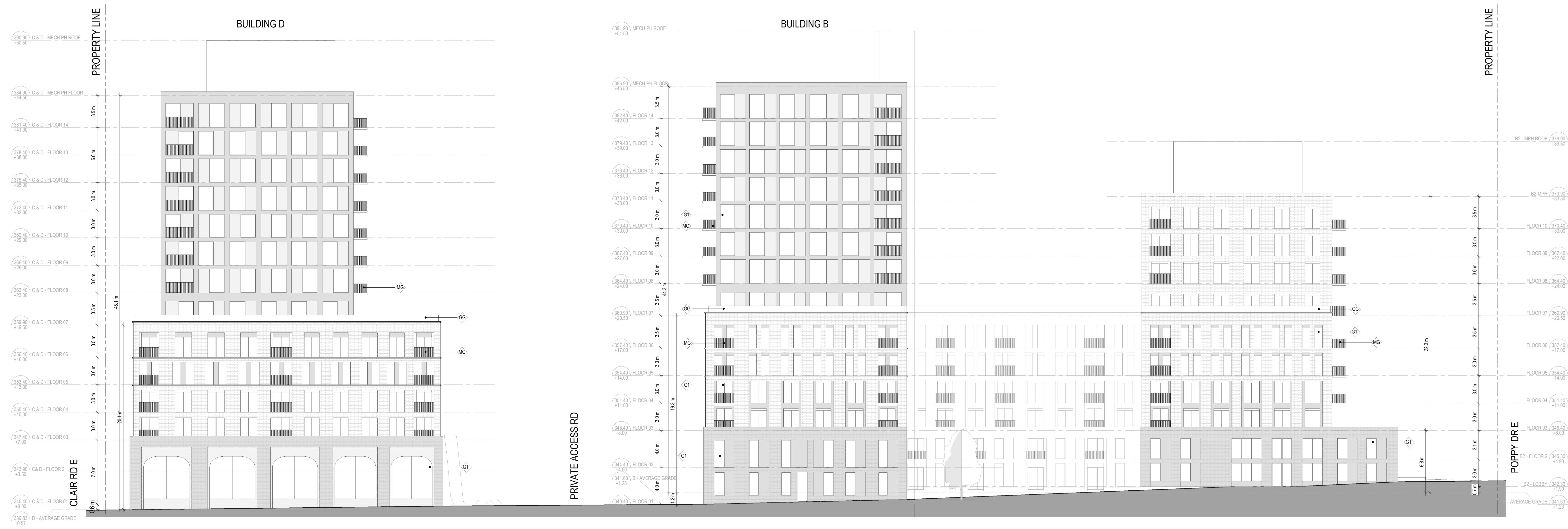
2 WEST ELEVATION A 302 1:200