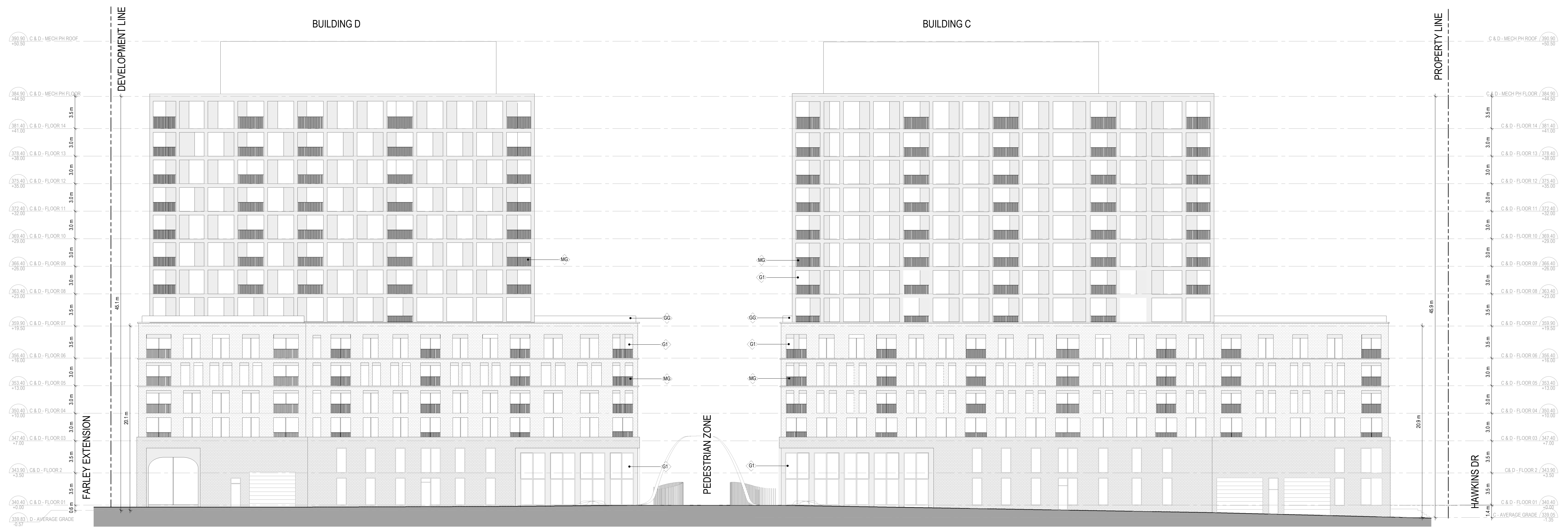
2 ELEVATION - BUILDING D & C SOUTH A 303 1:200