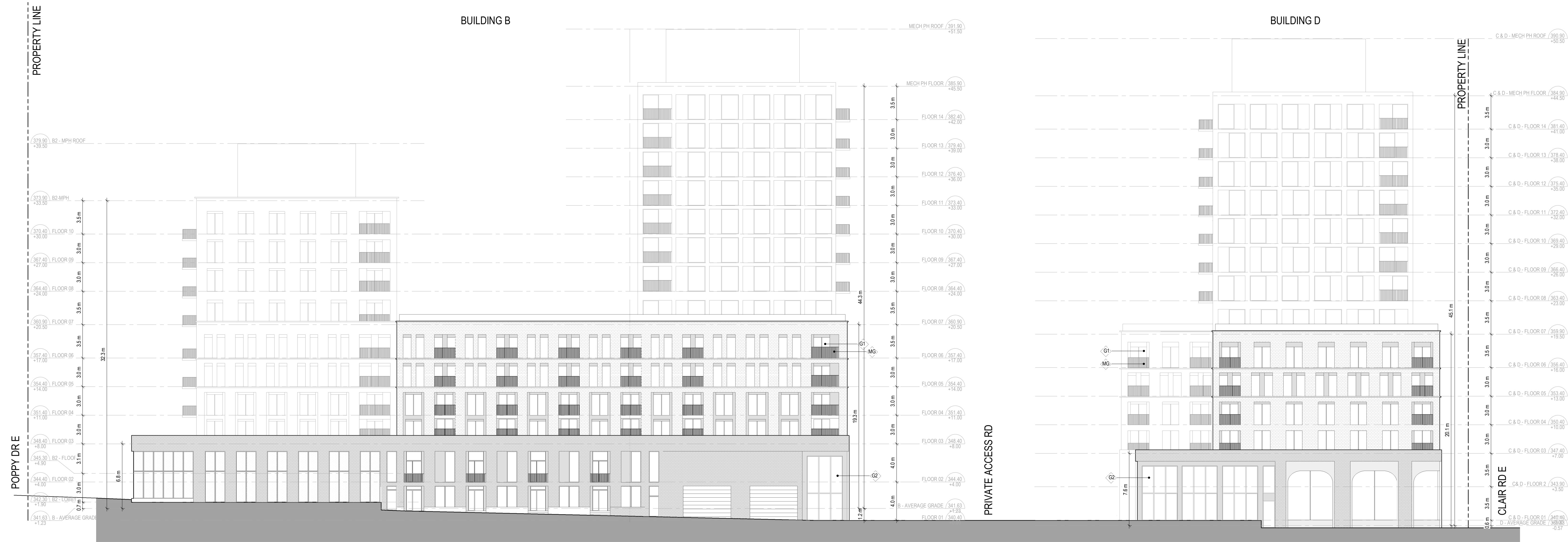
1 ELEVATION - BUILDING B & D EAST A 304 / 1:200