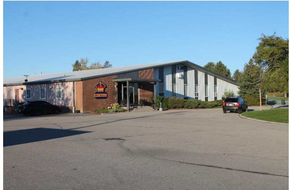
Guelph Curling Club

Based on previous comments received through the original application circulation and a change in land interest, the proposal has been revised which requires a revised Zoning By-law Amendment