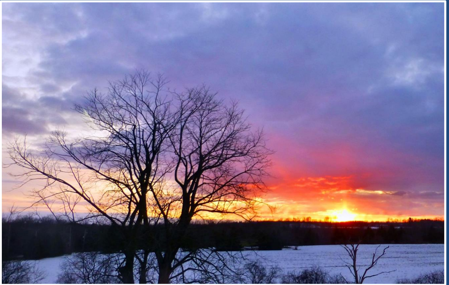
Sunset over the Niska portion of the Hanlon Creek Conservation Area looking west to the Speed River