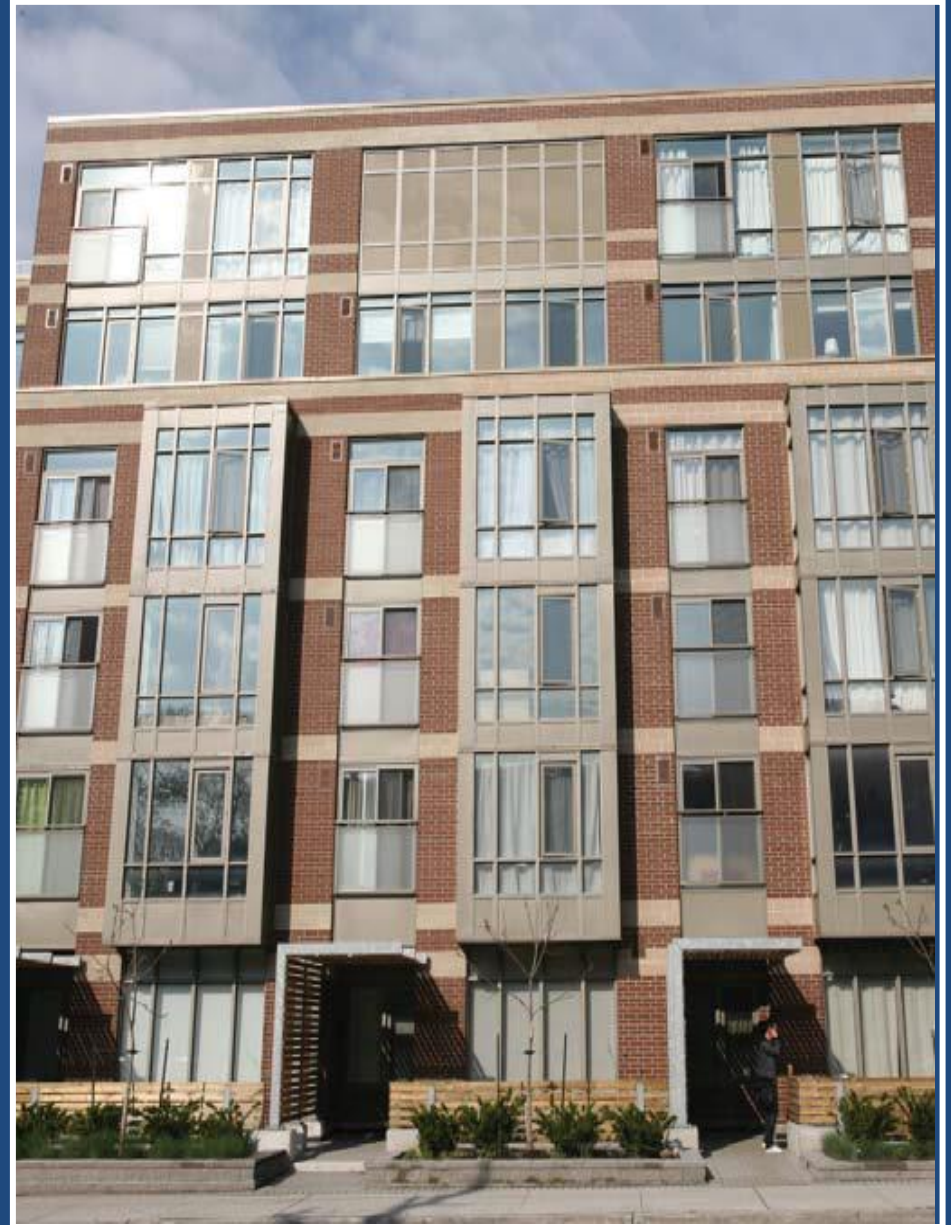
From pg. 2-3 Preliminary Design Directions Volume X Brook McIlroy April 2017