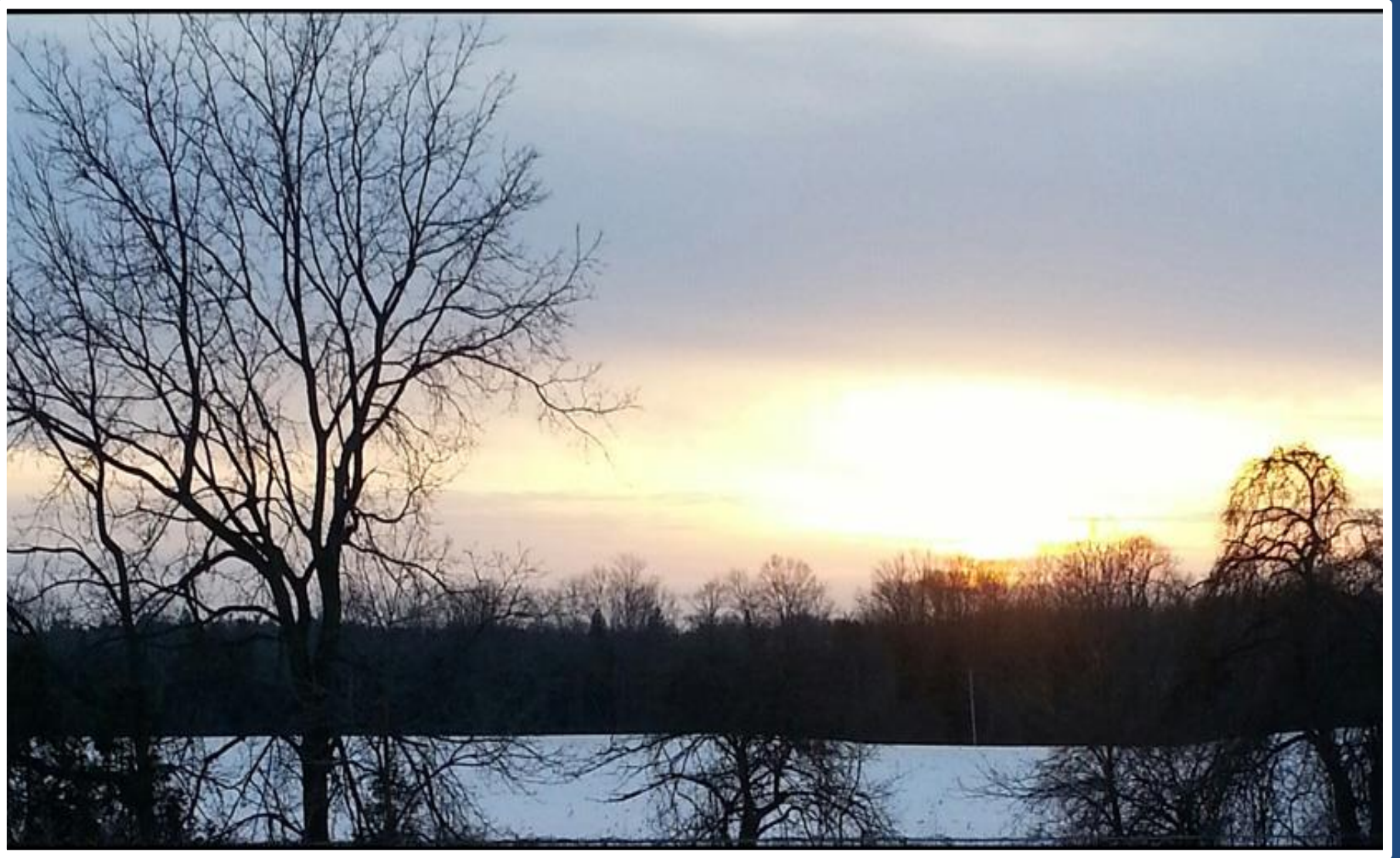
Winter sunset view over the Heritage Speed River Valleylands